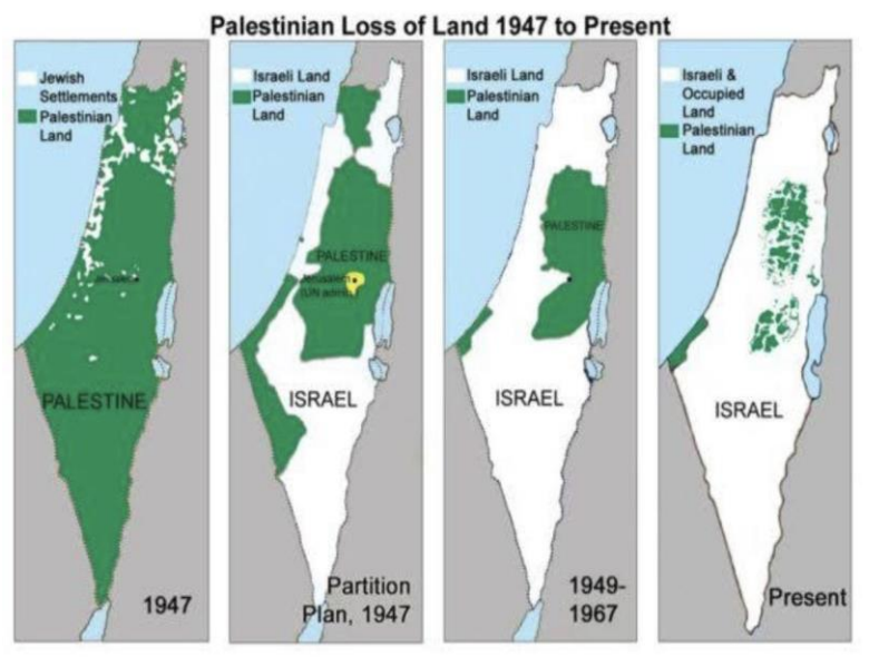
The Left in the European Parliament (2020)

This study is divided into five parts: the first is the introduction of the topic; with comprehensive background details about the Israel-Palestine conflict over Jerusalem and the United Nations' interventions, the second part is the literature review, which through the revision of past and present literature works, observed some gaps in literatures, concurred or contrasted what the authors have said. The third part of the study is the theoretical framework which addresses the aims of the study through the lens of Structural Realism. The fourth part which is analysis, findings and discussion explicitly examines the research aims, and through collected secondary data, analyses the Israel-Palestine conflict and peace processes in the twenty-first century. The final part of the study is the recommendation and conclusion.