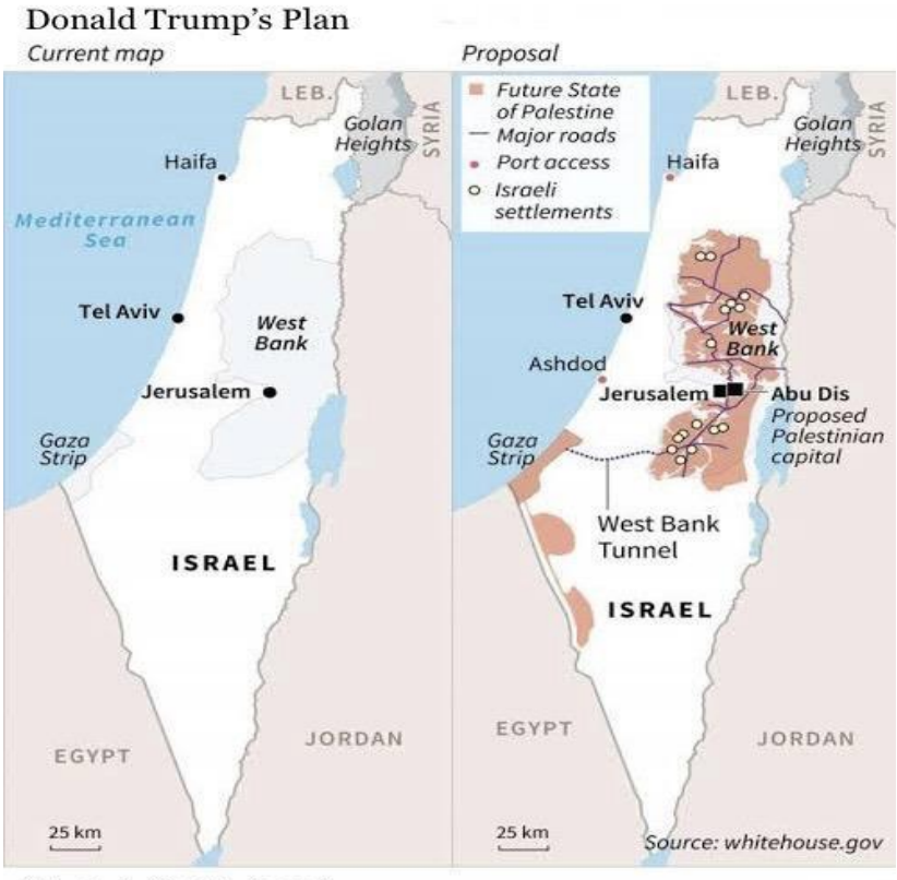
The Arab Weekly (2020)

Following the recognition of Jerusalem as the capital of Israel by the US in 2017, at a summit in Bahrain in July 2019, the Trump administration unveiled the economic part of its eagerly awaited peace proposal between Israel and Palestine. The conference's planning got off to an inauspicious start when the Palestinians declared they would boycott it because they believed it was an attempt to "buy off Palestinian political aspirations by financial means." However, even while few Arab countries sent lower-level representatives, the Arab states disregarded the Palestinians' request to boycott the conference (Council on Foreign Relations, 2022).