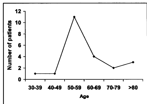
Figure 1: Age distribution of patients

The high QoL score at 4-5 year review was rated by an 88 years old woman who was unable to tolerate