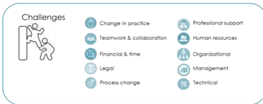
Figure 1: Challenges of BIM for QS practice

Clearly with the rate of BIM adoption among QS firms, there are challenges spelled out, as follows, in adopting BIM as it is relatively new to surveying practice (Figure 1):